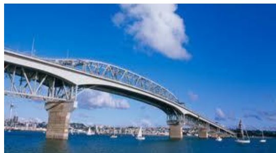
Auckland Harbour Bridge