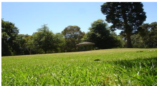
View of Cornwall Park

The College has a highly qualified and experienced Academic Faculty who are specialists in their field. Professional teaching staff are practitioner educators who work, research, and educate in their fields. Professional practise in the discipline they now teach increases the quality of teaching. This can be a powerful influence for students embarking on a career in healthcare. In addition, all faculty in the BHSc and MCM are research-active and bring their research interests into the teaching. Continued professional development in both subject content and educational, academic, and clinical practice is a unique, distinctive characteristic of NZCCM.